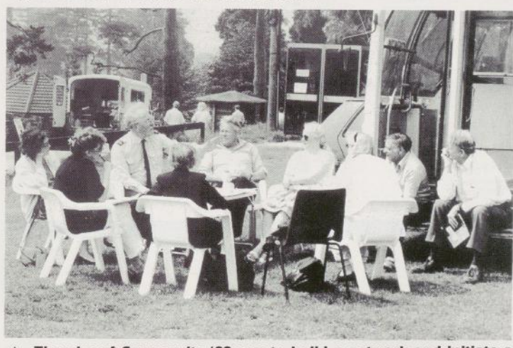
△ The aim of Community '89 was to build a network and initiate a dialogue.

So, at the close of the year the minds of all involved were focussed on the event in two months time.