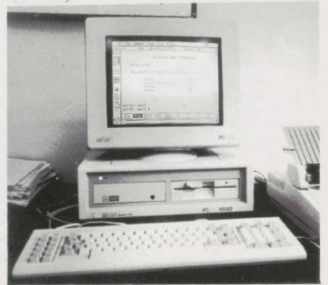
Computer training has been offered and many queries answered on computer related topics.

The Welsh Information Network was subsequently successfully launched at Community '89 in May 1989.