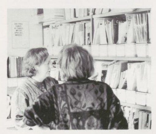
Enquiries to the Information Department have increased sevenfold over the last four years.

In depth research was completed on topics ranging from Urban Aid, funding in the voluntary sector, to current parliamentary issues.