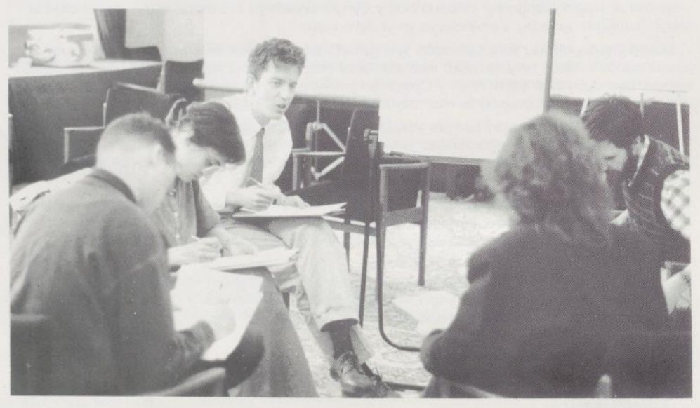
△ Nearly 500 people attended the 28 workshops and seminars organised during the year.

WCVA has run 17 one, two and three day events for organisations in Wales that include West Glamorgan CSC, Cyngor Gwlad Gwynedd, GAVO, WHAC, the Welsh Consumer Council and Powys Rural Council. Two important initiatives are the Council's involvement in the Wales Association of County Voluntary Council's Staff Development Programme, and the seminars organised in March and April 1989 for Welsh Office grant-aided organisations and officers from key Welsh Office departments on the development of useful evaluation processes.